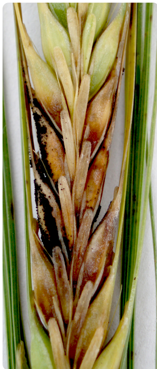
Fusarium head blight on barley.

Then about a decade ago, Hayes’ program at Oregon State released the GNO variety ‘Full Pint’ ( https://bit.ly/3Y5RpPi ). The appearance of the GNO allele in the Oregon State breeding program and Full Pint’s subsequent GNO status was also a happy accident, Hayes says. “It’s a testimony to the power of free exchange of germplasm between breeding programs because it just came kind of hitchhiking along with crosses that we had made with material from the ICARDA/CIMMYT program in Mexico”