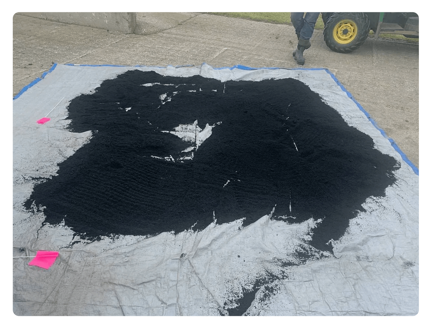
Some of the studied biochar prior to soil application.