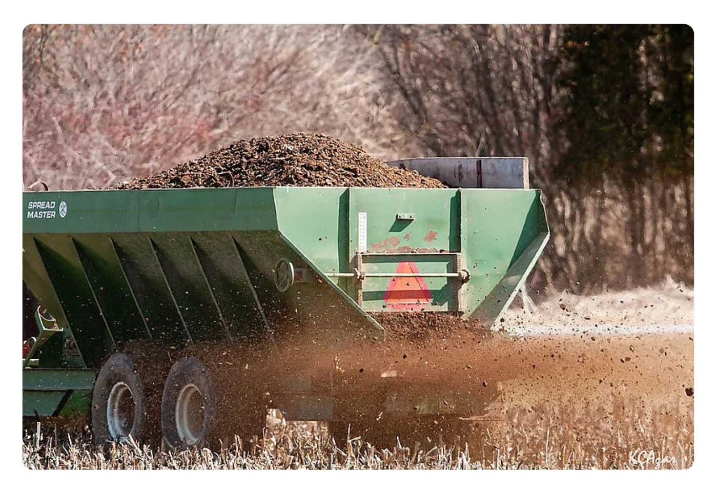
If you fertilize your fields with manure, it's unlikely you'll see a significant sulfur deficiency since manure contains sulfur.