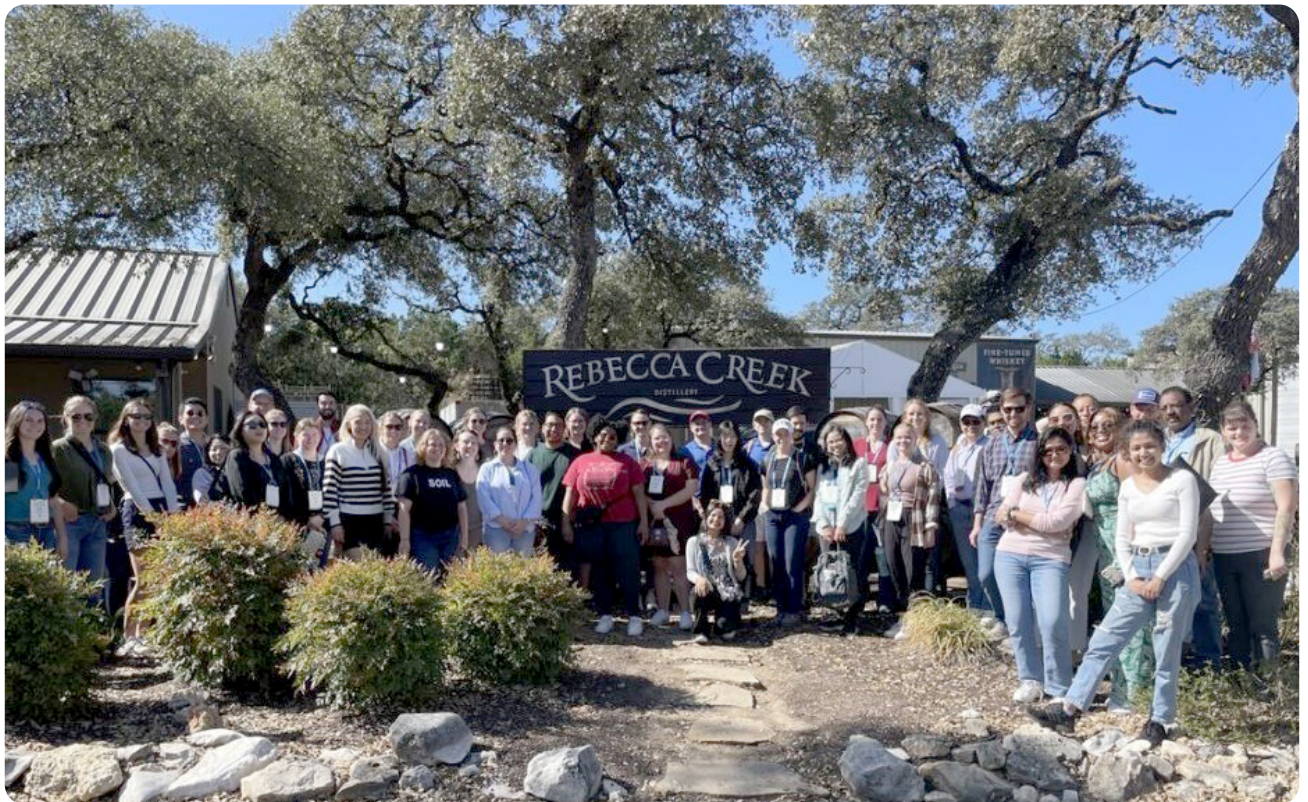
Participants of the CANVAS 2024 graduate student tour wrapping up the day at the Rebecca Creek Distillery in San Antonio, TX.