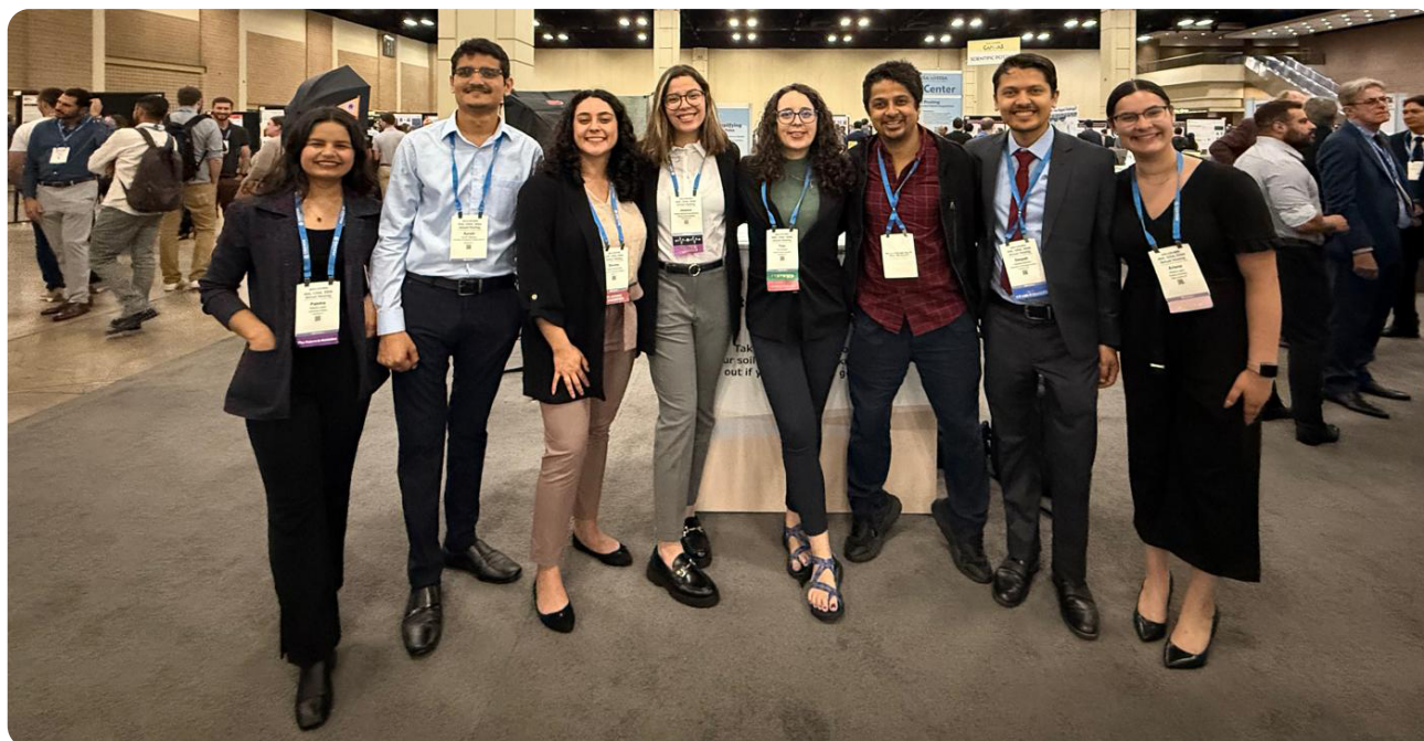
The ACS Graduate Student Committee members meeting in person at CANVAS 2025.