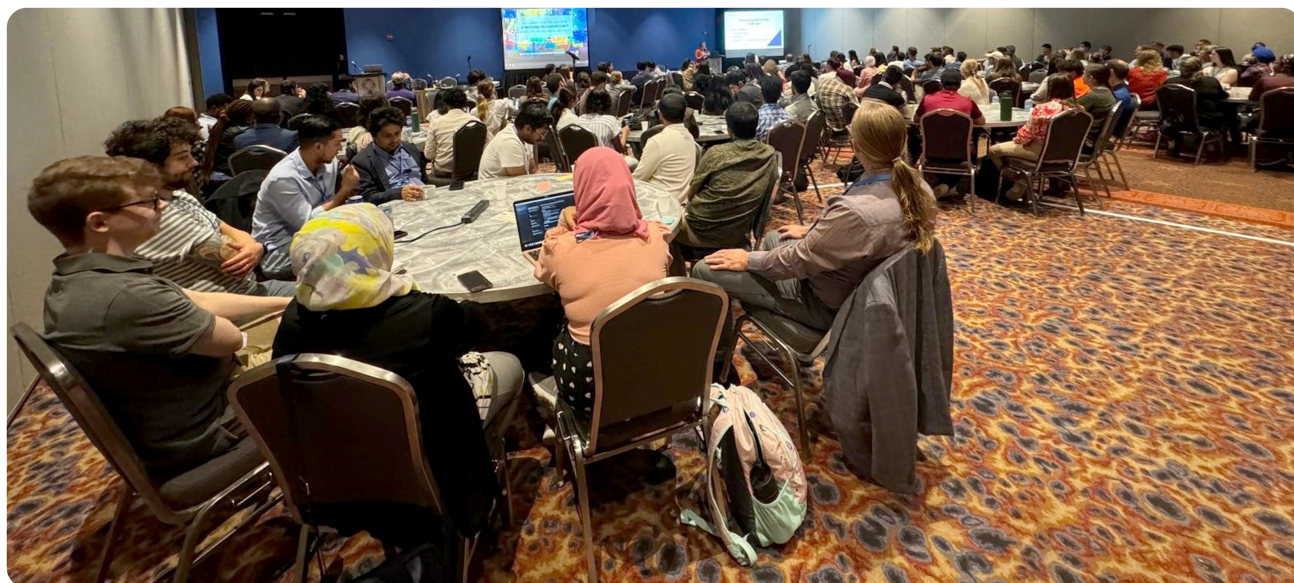
Graduate students chatting with mentors during the “speed-date” style interaction period at the Graduate Student Networking Session.