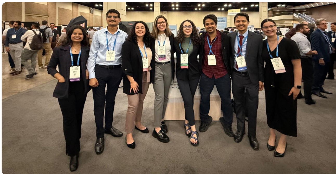
The ACS Graduate Student Committee members meeting in person at CANVAS 2025.