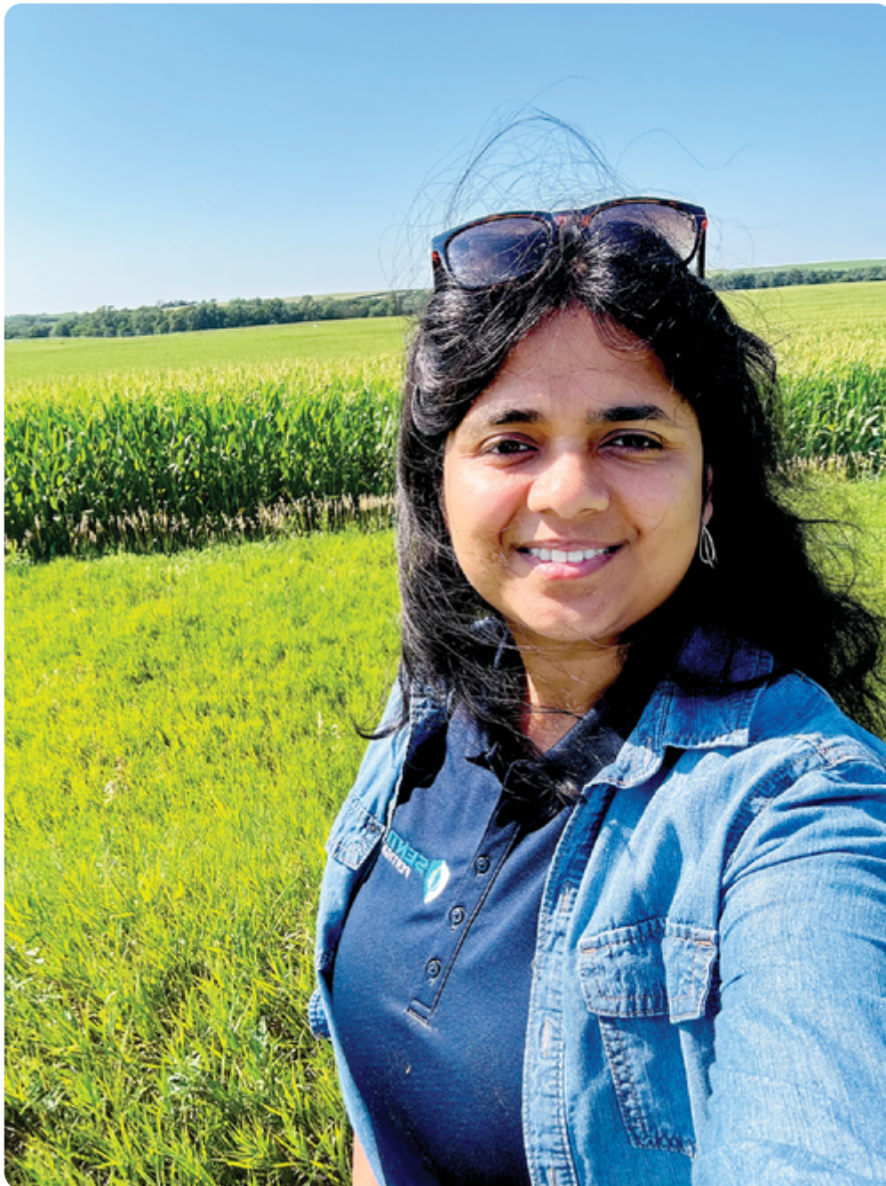
Figure 2. Scouting a corn field in eastern Nebraska.