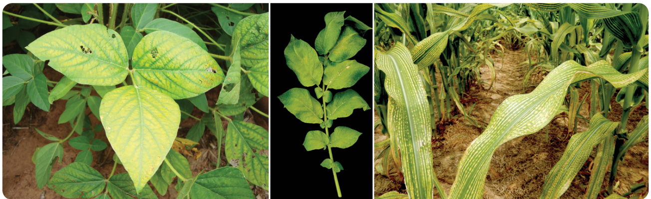
Magnesium deficiency in (l to r) soybean, potato, and corn.

(2) the Mg/K ratio appears to influence taste and sensory properties through cellular cation/anion balances, juice acidity, and total soluble solids.