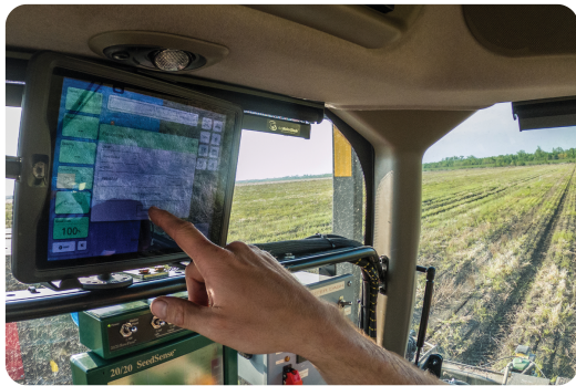
A farmer in a tractor/planter equipped with a planter monitor, a precision agriculture tool, to guide seed planting.