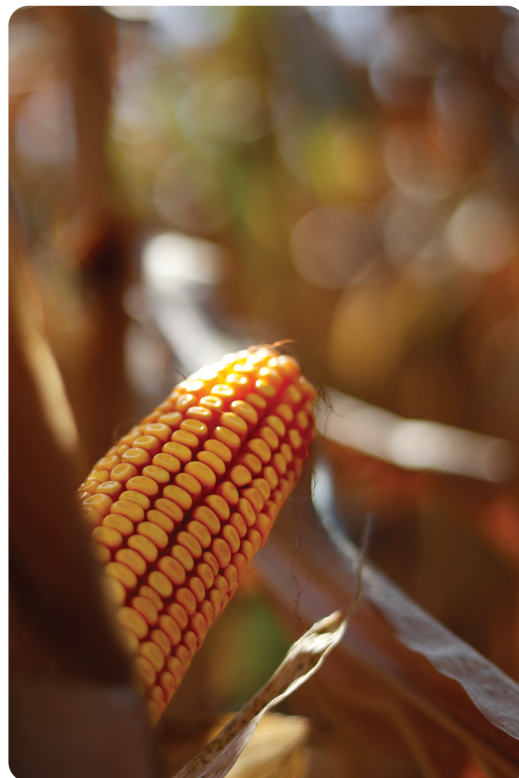
“Corn’s Golden Symphony” by Nitish Inu was the Agronomy Best Photo during the photography and video contest held during the 2023 Annual Meeting in November.