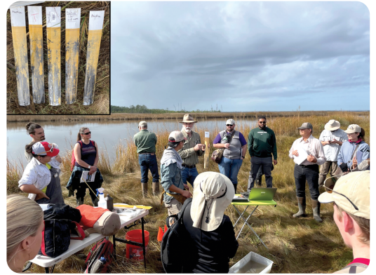
Figure 2. Attentive group discussing new applications of IRIS (Indicator of Reduction in Soils) technology for measuring soluble sulfide levels in marsh porewater. Inset: IRIS showing black FeS coatings formed quickly when deployed in the marsh soil.