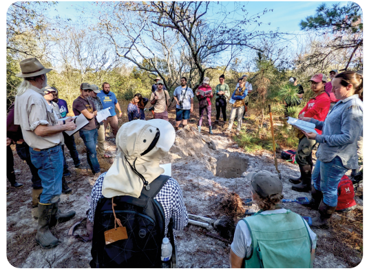
Figure 4. Engaged discussion of carbon dynamics, pedogenesis, and nearby hydric soil indicators while examining a pit in recent overwash deposits on Assateague Island.

please view Jordan Kim’s recorded oral presentation from the 2022 Annual Meeting ( https://bit.ly/3ZcsVUa ).